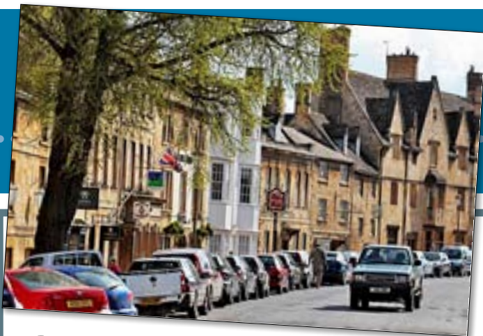
CHIPPER: Campden's stunning high street