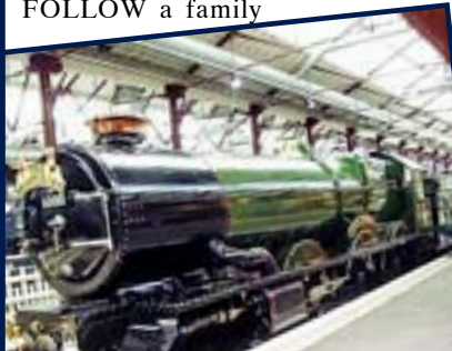
BACK TRACK: Learn about The Bristolian

trail around the grounds of this National Trust property to learn how animals spend the winter. It runs until November 30, between 11am and 4pm. See www.nationaltrust.org.uk .